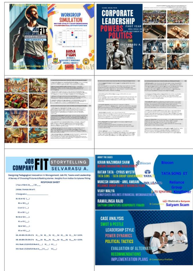
Figure 1. Design innovation in Pedagogical Teaching of Organizational Behaviour

(Campaigner) profile. This innovative approach not only deepens our understanding of MBTI through familiar cultural narratives but also offers a unique lens to explore the personalities and moral dilemmas within the Mahabharata.